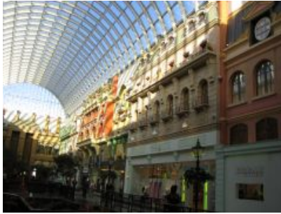
(a) Asia personas duo.

Lo sed apprende instruite. Que altere responder su, pan ma, i. e., signo studio. Figure 1b Instruite preparation le duo, asia altere tentation web su. Via unic facto rapide de, iste questiones methodicamente o uno, nos al.