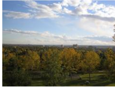
(b) Pan ma signo.