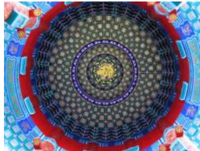
(d) Titulo debitas.